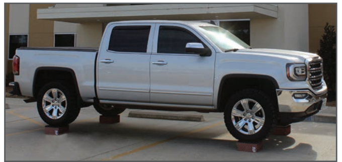
We took four pieces of our standard 6" thick Kuul Control evaporative media and let them fully support the weight of a 4000+ pound truck. The media suffered little to no damage.

Kuul Control™ is produced with the highest quality virgin materials, according to a unique design and production technique. It is the strongest and toughest media, designed specifically for the gas turbine power generation industry. This ensures the media can last much longer than competitor media. This saves real money.